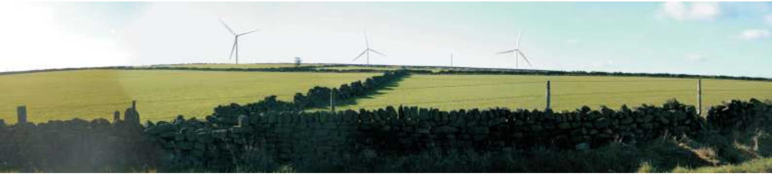
Photomontage. The potential view of the proposed development from Spicer House Lane.