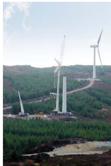
Construction at Deucheran Hill Wind Farm, Kintyre.