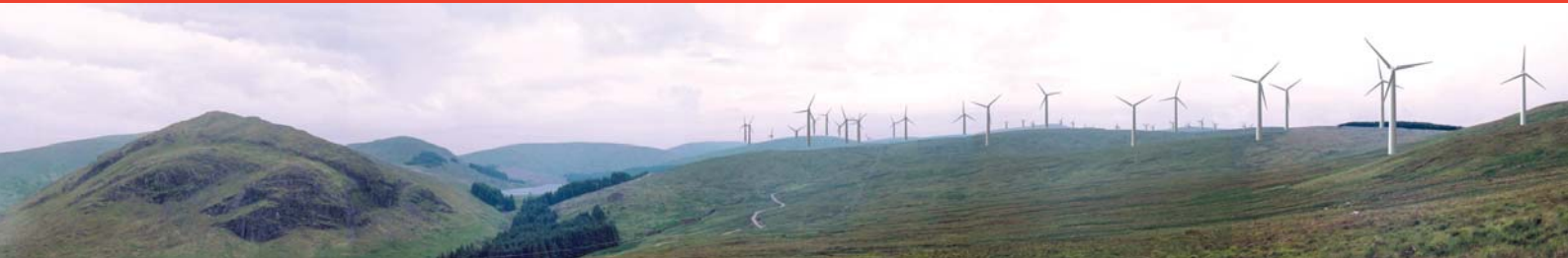
This photomontage shows the proposed Afton turbines in the foreground, with existing turbines from the adjacent existing Windy Standard Wind Farm in the background. Afton Reservoir can be seen in the valley. Note that the image is reduced in size and is provided for illustrative purposes only.

Keeping you up to date with the progress of the Afton Wind Farm proposal