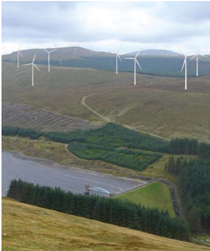
Photomontage from Craigbraneoch Hill